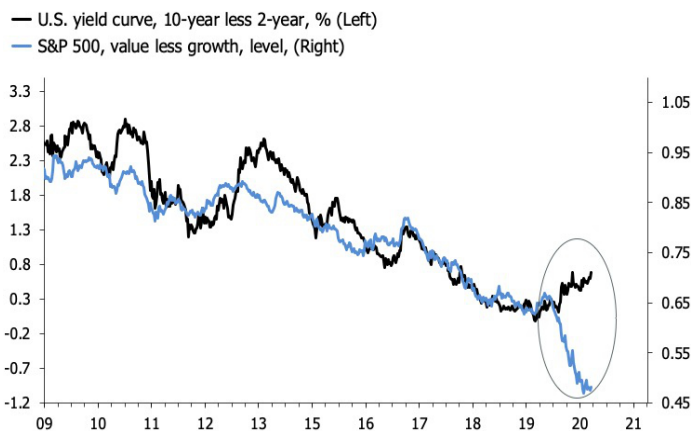
fig. 01 / This gap will close, but how? - fig. 02 / It doesn't look dramatic for DXY, yet

3. Weak dollar - > declining valuations in risk assets - This is the scenario in which the U.S. squanders its exorbitant privilege, and global capital decides to go somewhere else. The